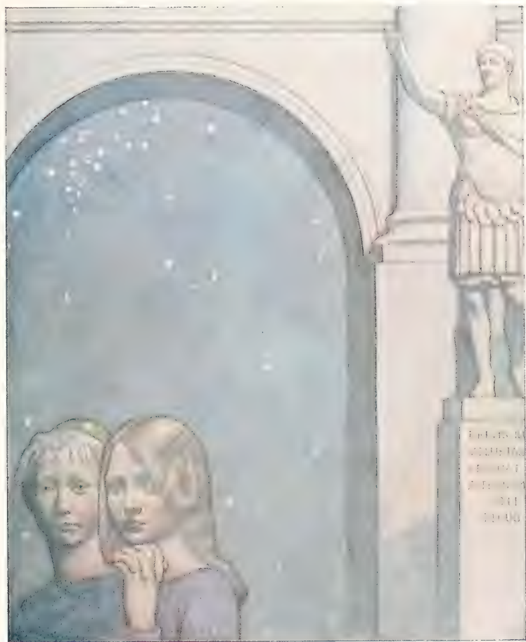
THE CHILDREN ENTER THE PALACE OF LUXURY